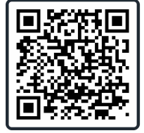
Senate Bill No. 19

EMERGE is a Master's Degree tuition assistance program for members of the Kansas National Guard which will help make college education more accessible and affordable for service members. (Reference: Senate Bill No. 19; 2024 legislative session). Up to 100 applicants per school year accepted, with a cap of 200 applicants allowed in the program.